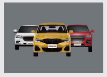
Wide Coverage (Support 98% car makes)